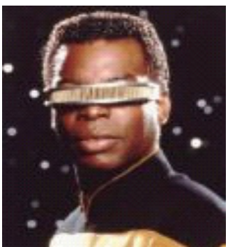
LeVar Burton as Geordi LaForge