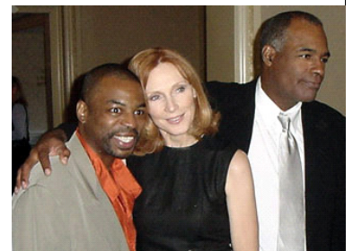
LeVar Burton, Gates McFadden and Michael Dorn